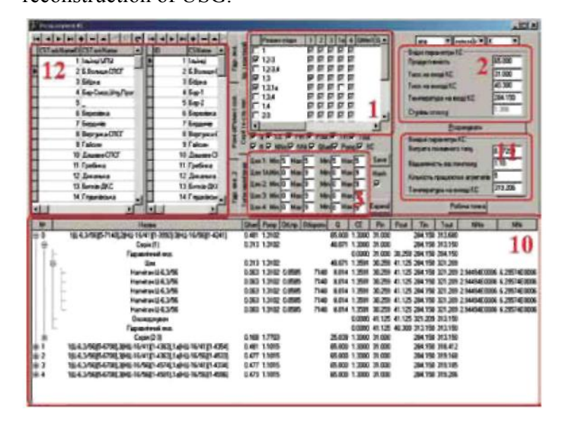
Figure. 1. Main form of the program "Calculation of Bilche-Volytsia DKS"

Timely performance of many-time calculation for search of optimal mode parameters on considerable intervals and in case of necessity comparative analysis of possible variants of reconstruction of USG.