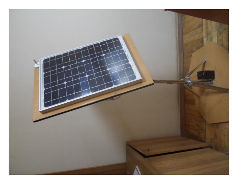
Fig. 2. Technical parameters of solar panels

On the basis of the carried research it is proposed to conduct a comprehensive assessment of environmental safety based on the current organizational structure of the environmental monitoring and information model by involving specially formulated environmental indicators and indices of quality.